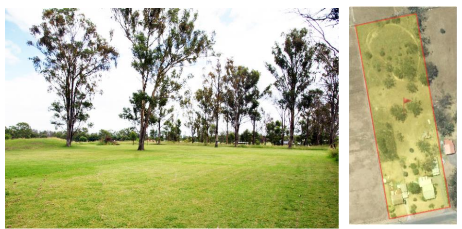
From a paddock to a church: MPC Marsden Park site

3. The 1-hectare site has sufficient land area on which to construct a new ministry centre with car parking areas and room for future expansion in the coming decades.