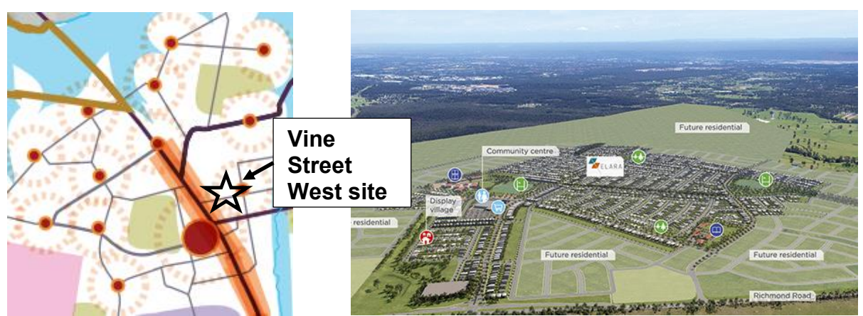
Stockland Marsden Park Development The MPC site is in close proximity to new residential development

5. Residential development has commenced at a number of land release areas in Marsden Park including the Stockland Elara development that will eventually be home to around 2,000 families.