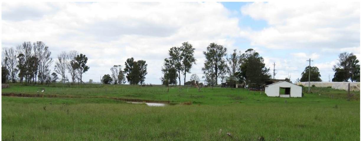
From a paddock to a church:

5. The cost of $4.65 million was materially funded by all parishes across the Diocese through the Synod approved greenfields land acquisition levy ordinance (the “Ordinance”). The Ordinance commenced in 2013 and promotes the Diocesan Mission 2020 . This enables all parishes to support the establishment of church sites in new growth areas.