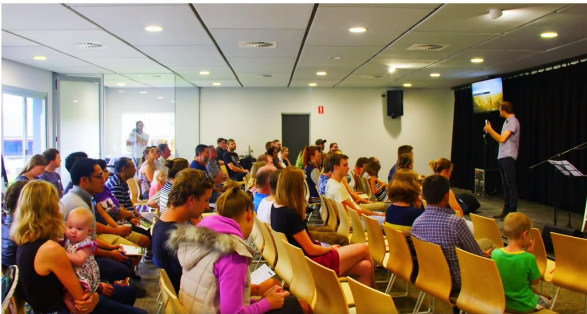
Leppington church building

8. The Leppington church building involved refurbishment of an existing building with capacity of 100 persons for the growing church and community. Opened in March 2017, the project features a kitchen, Sunday school rooms and car parking area. A nearby ministry residence provided by MPC was completed in November 2016.