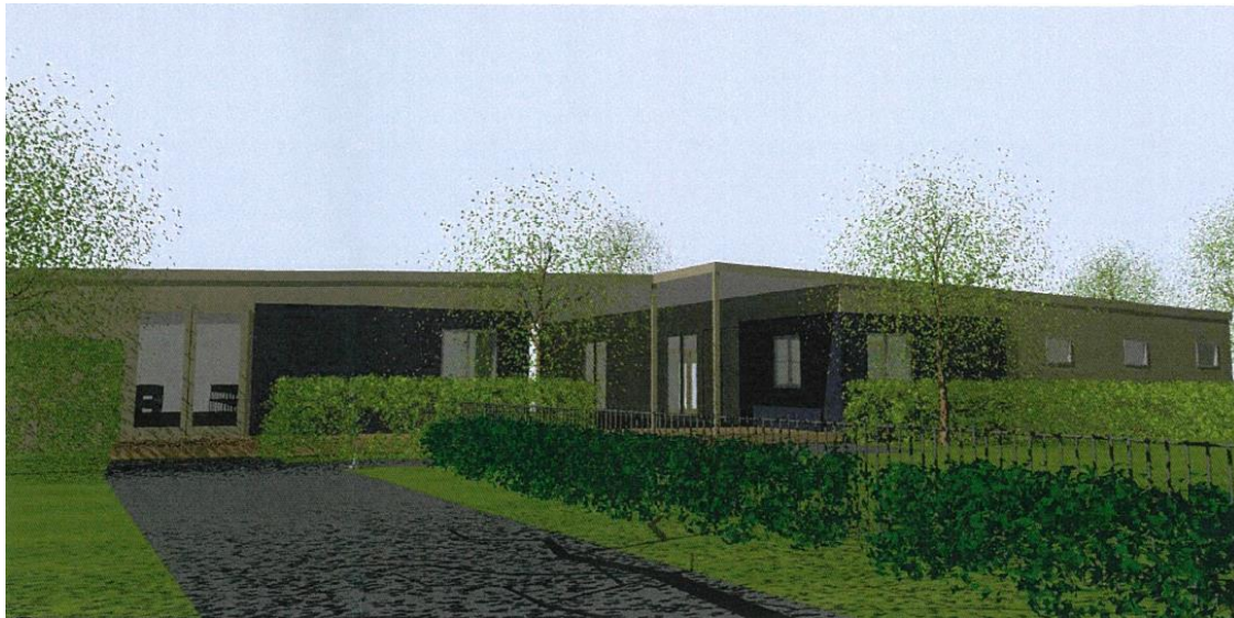
Wilton Relocatable church building

6. A relocatable church building with capacity for 150 seats and 4 Sunday school rooms and associated amenities and car parking is under construction for location at the Wilton church site. With new families moving into the Wilton Junction area, the congregation has outgrown the existing heritage church building with a capacity of 40 seats. It is anticipated that the building will be completed by December 2018. The MPC will also continue the search for a new church site to be acquired to meet the long term growth of the Wilton Junction area. The relocatable building will accommodate growth over the next 5+ years after which it is planned to relocate to an alternative greenfields growth corridor.